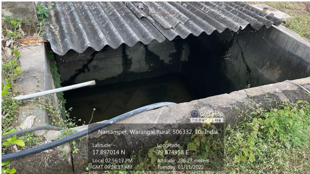
Supply of treated water for several purpose of watering plants and gardening.