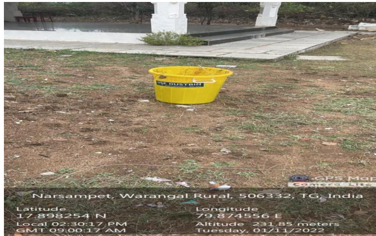
Collecting wastage to recycle.