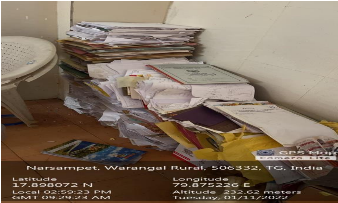
Preservation of paper waste from all department for the purpose of selling to vendor.