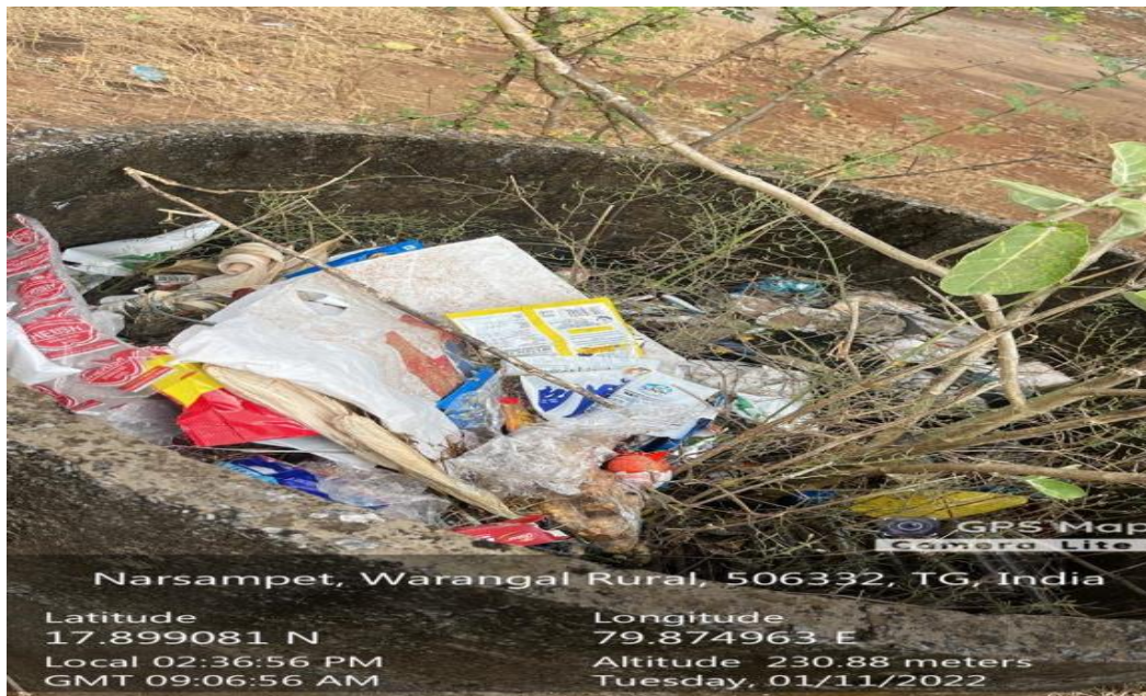
Disposal area for the purpose of burning.