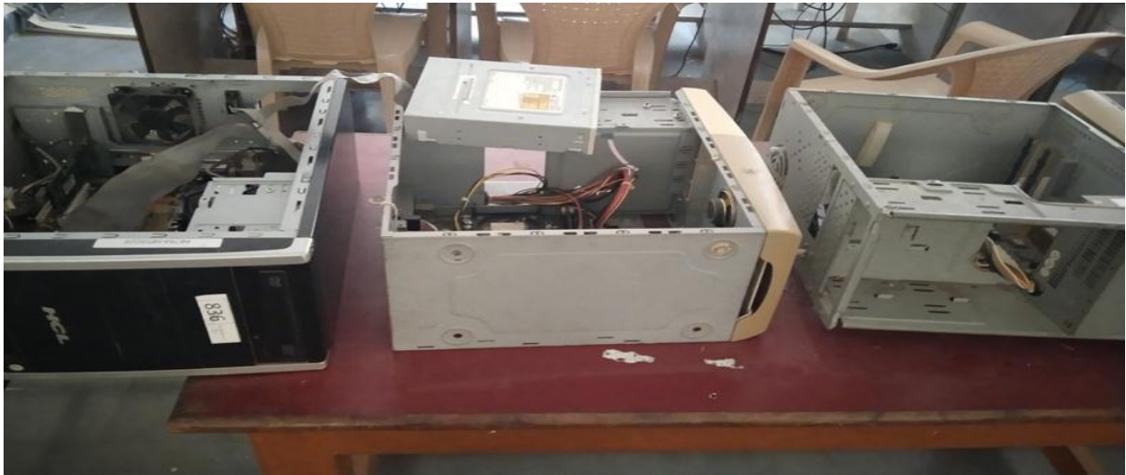
Segregation of e-waste from all department computer peripherals.