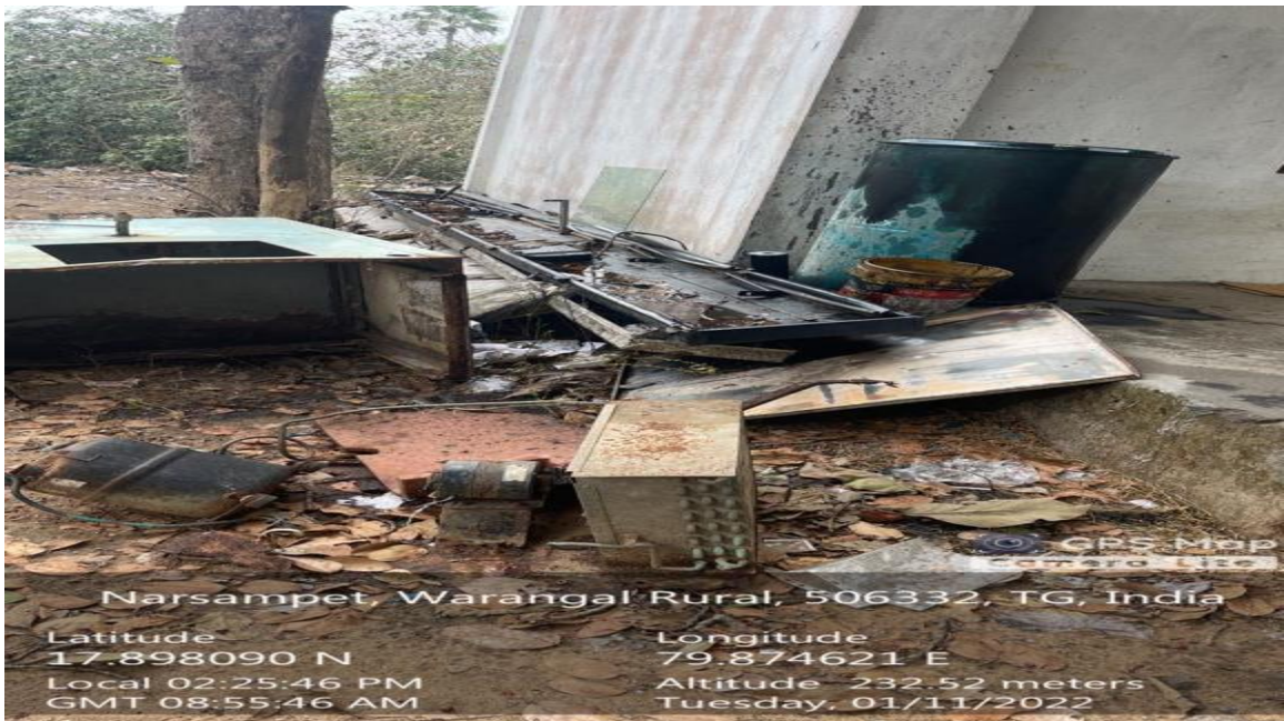
The Electronic Equipment stored for the purpose of dismantling.