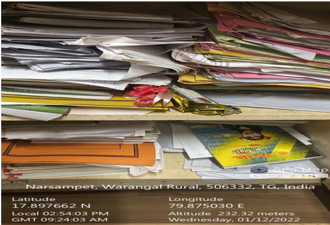
Preservation of old records from all departments.