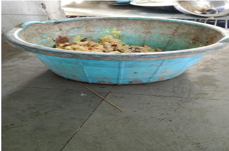
Canteen Wet waste is collected at backyard to feed cattles.