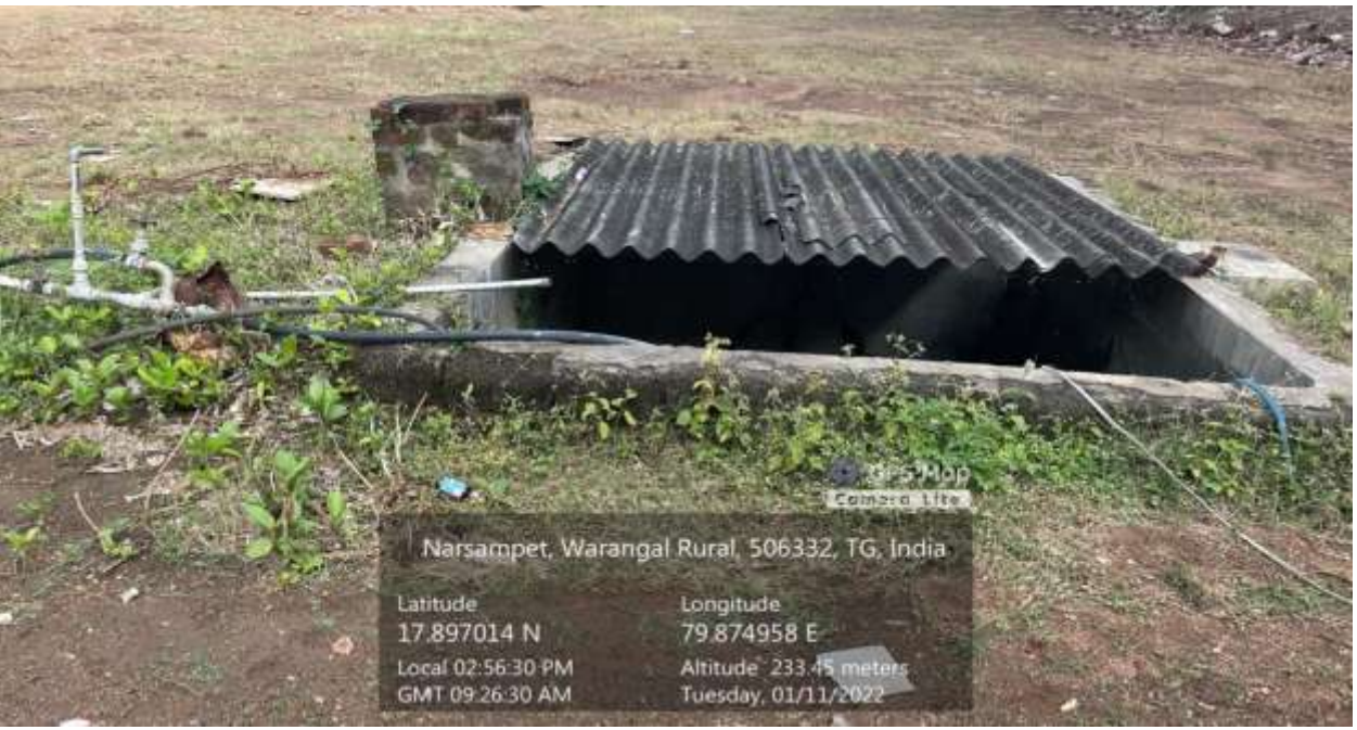
Bore wells constructed to take under ground water to supplies for usage.