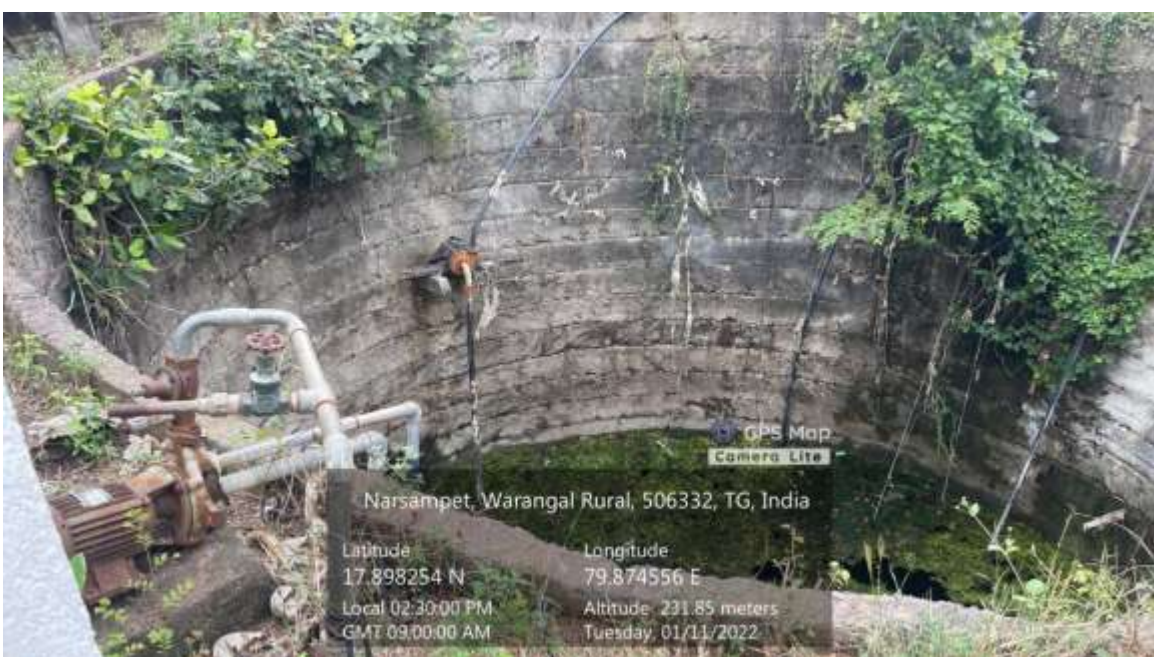
Open wells connected with motor to supply water to different areas.