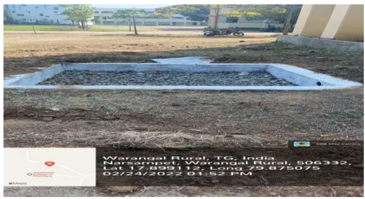
Rain water Harvesting Pits.