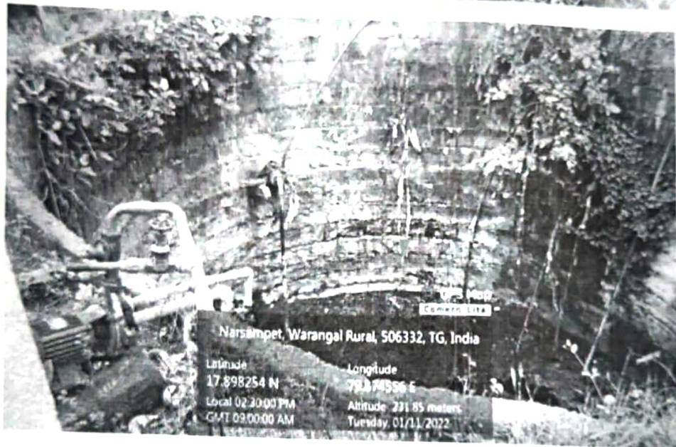
Open wells connected with motor to supply water to different areas.

Ganesh 5/4/22 Principal Jayamukhi Institute of Technological Sciences Narsampet, Warangal-506332