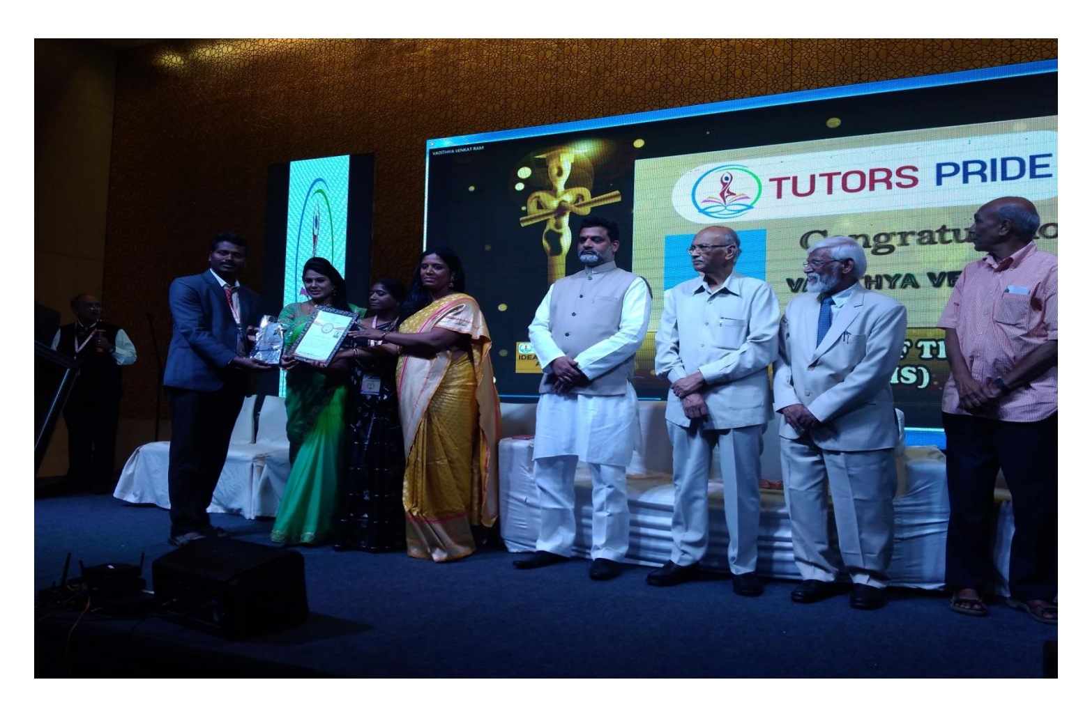
Tutor award by Tutors Pride