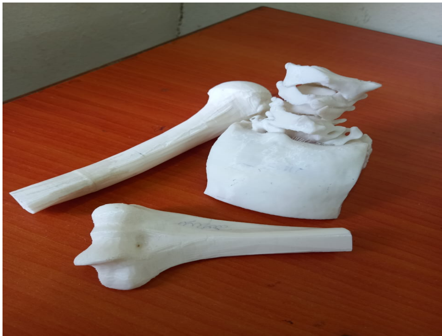
Figure 3: Models Prepared by Students