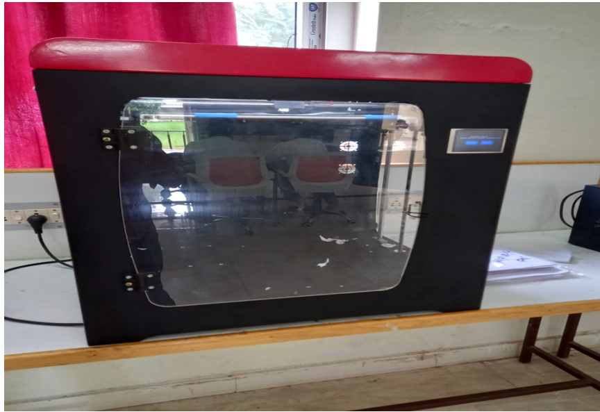
Figure 1: 3D Printer

Glimpses of "Skill Development Program on 3D Printing, 3D Scanner and CNC Wood Cutter "